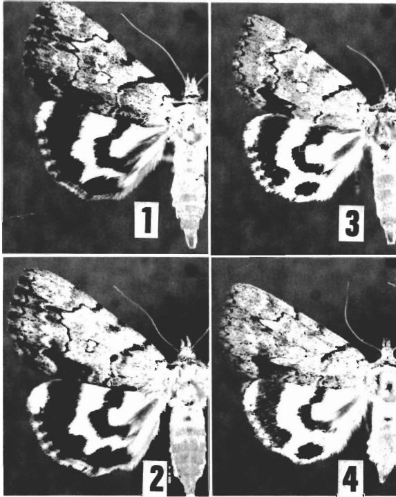
FIGS. 1-4. Catocala adults from the C. charlottae type locality. 1, C. charlottae , ♂ holotype; 2, C. charlottae , ♀ allotype; 3, C. alabamae , ♂ coll. 13 May 1985; 4, C. alabamae , ♀ coll. 10 June 1985.

and size; the only noticeable exterior difference is the slightly darker appearance of Florida specimens. Forewing lengths of male Louisiana C. charlottae (N = 108) average 7% larger than those of male Louisiana alabamae which average 18.2 mm (16.6-19.5 mm, N = 20). Forewing lengths of female Louisiana C. charlottae (N = 32) average 9% larger than those of female Louisiana C. alabamae which average 19.1 mm (17.9-20.1 mm, N = 14). The upper forewings of C. charlottae lack the overall blue-green suffusion present on C. alabamae . Occasionally, fresh C. charlottae exhibit a few diffuse greenish scales around the reniform, but these are sometimes evident only with magnification.