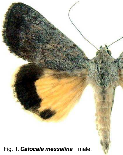
Fig. 1. Catocala messalina male.

The upper forewing of messalina is nearly unremarkable and dull gray, with a hint of bluish tinting, the outer edge of the forewing is very dark gray, nearly black in color. The hindwing has no inner band, only a black outer band from apex to near anal angle. The remainder of the hindwing is dull yellow-orange.